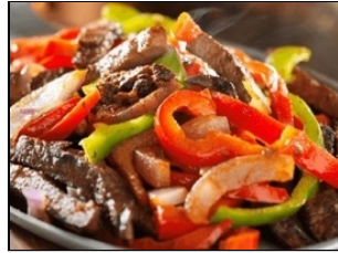
Houfbrau 2 Beef Fajitas' $ 14.99