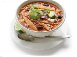
Soup Chicken Tortilla Soup' $ 5.99