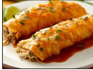
Houfbrau Chicken Enchiladas' $ 13.99