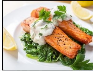
Entree 1 Lemon Taragon Salmon' $ 14.99