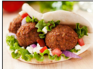
Entree 2 Homemade Falafel with Hummus and Pita ' $ 13.99