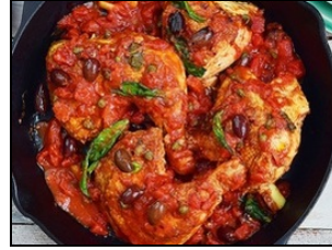
Houfbrau Spicy Chicken Puttanesca ' $ 13.99