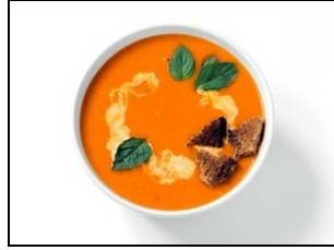
Soup Tomato Bisque Soup ' $ 5.99