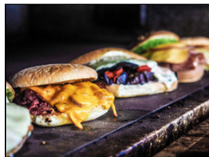
Special Sandwich Skirt Steak Sandwich ' $ 12.99