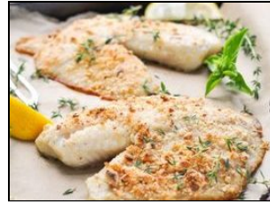
Entree 1 Parmesan Crusted Baked Basa Fish ' $ 14.99