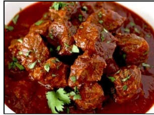
Houfbrau 2 Chili Colorado ' $ 14.99