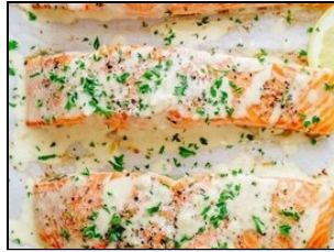
Entree 1 Atlantic Salmon with Basil Cream' $ 14.99