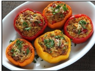
Entree 2 Vegetarian Stuffed Bell Pepper' $ 13.99