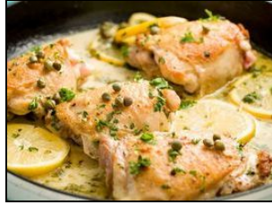
Houfbrau Chicken Piccata' $ 13.99