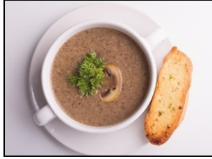
Soup Cream Of Mushroom Soup' $ 5.99