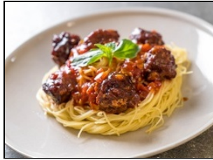
Houfbrau 2 Spaghetti And Meatballs' $ 14.99