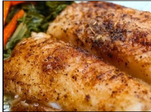
Houfbrau 2 Grilled Basa Fish' $ 14.99