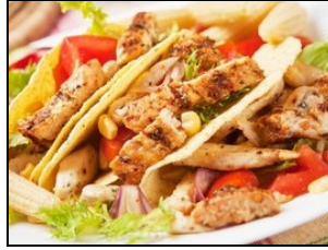
Houfbrau Chicken Taco' $ 13.99