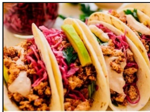
Entree 2 Veggie Taco (Soyrizo)' $ 13.99