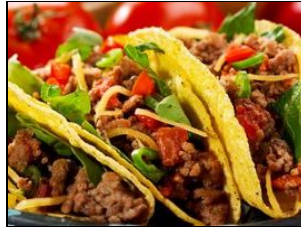
Entree 1 Beef Taco' $ 14.99