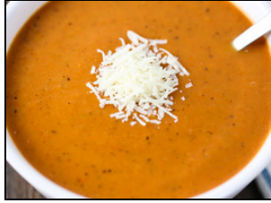
Soup Tomato Bisque' $ 5.99