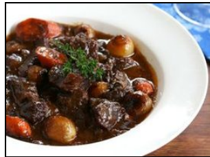
Houfbrau 2 Beef bourguignon' $ 14.99