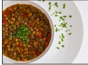
Soup LENTIL SOUP' $ 5.99