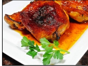
Houfbrau Honey Garlic Chicken Thigh' $ 13.99