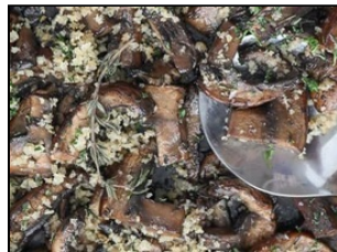
Entree 2 Garlic Butter Portobello Mushroom' $ 13.99