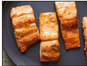
Entree 1 Garlic Brown Sugar Glazed King Salmon' $ 14.99