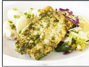
Entree 1 Herb Crusted Basa Fillet' $ 14.99