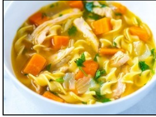
Soup CHICKEN NOODLES SOUP' $ 5.99