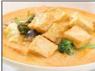
Entree 2 Thai Tofu Yellow Curry' $ 13.99