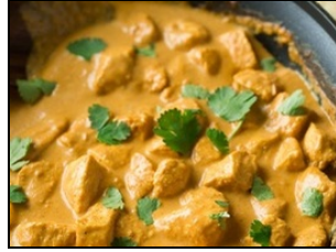
Houfbrau Chicken Curry' $ 13.99