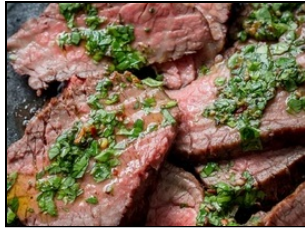
Houfbrau 2 Tri-Tip ' $ 14.99