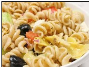
Entree 2 Greek Pasta ' $ 13.99