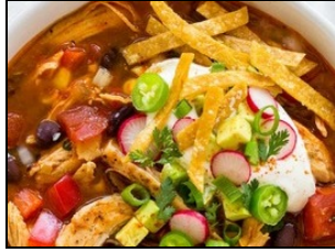
Soup Chicken Tortilla Soup' $ 5.99