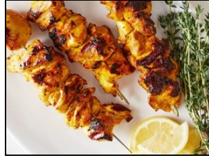
Houfbrau Thigh Chicken Kebabs' $ 13.99