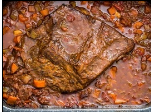
Houfbrau 2 Jewish Beef Brisket ' $ 14.99