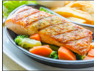
Entree 1 King Salmon ' $ 14.99